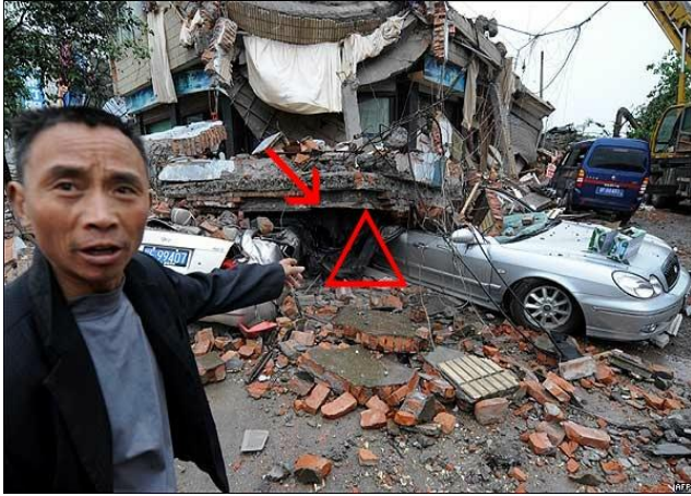
Save your life with "The Triangle of Life"

If you are inside a vehicle, come out and sit or lie down next to it. If something falls on the vehicle, it will leave an empty space along the sides. See below: